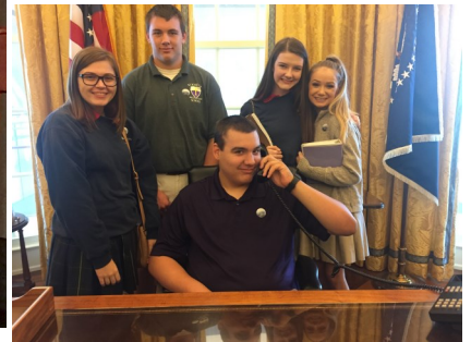
While visiting the Clinton Library, these students posed in a life-sized replica of the White House's Oval Office.