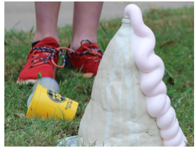
The lava flows.