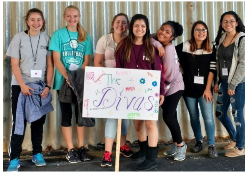
Small groups talked about the Holy Spirit.