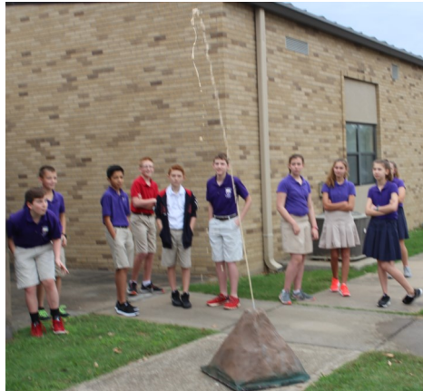
The class watches it erupt.