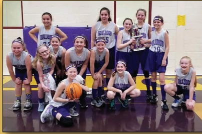
5th grade girls placed 2nd in Conference