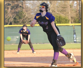
SJ Softball Record 1-2