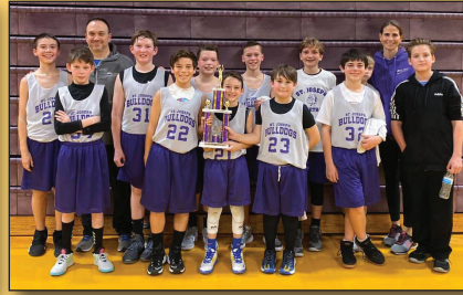
6th grade boys placed 2nd in Conference.