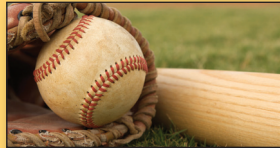
SJ Baseball Record 2-1

Boys Soccer Record 0-0-1. They were only able to play one game.