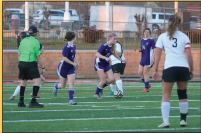
Girls Soccer Record 1-2-1