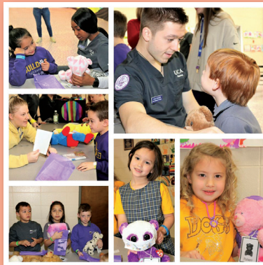
A Teddy Bear Clinic was held for Preschool and Kindergarten students in conjunction with UCA nursing students.