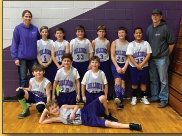
4th grade boys Conference champs