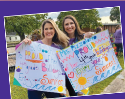
SJS students came together in a parade to wave at and share smiles with our Preschool, Elementary and Middle School Teachers and Staff Members. The parade was led by two Conway police motorcycles and a fire truck. About 130 families were in attendance. It isn't the way we wanted to end our school year, but the sweet memory of this parade will last for a lifetime.