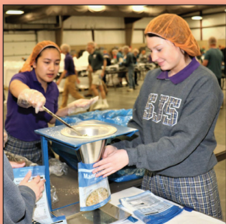
Tenth through 12th graders helped to pack nutritious meals for hungry children around the world with the Conway Mobile Pack that was co-sponsored by Tacos 4 Life and the Feed My Starving Children (FMSC) organization.