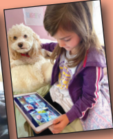
Our students stayed busy learning