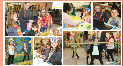
Annual Family Literacy Night at SJ Elementary School