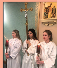
Students participate in Stations of the Cross weekly on Fridays during Lent.