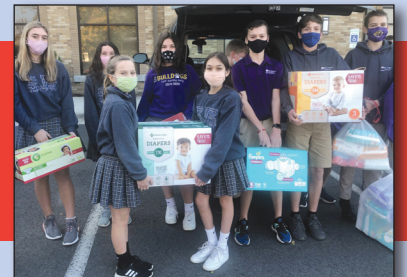
SJ High School religion classes recently donated more than 1,000 diapers and about 100 infant outfits to Conway's Life Choices as an Advent project.