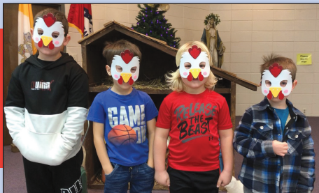
SJ Preschoolers performed, "The Friendly Beasts: A Christmas Poem."