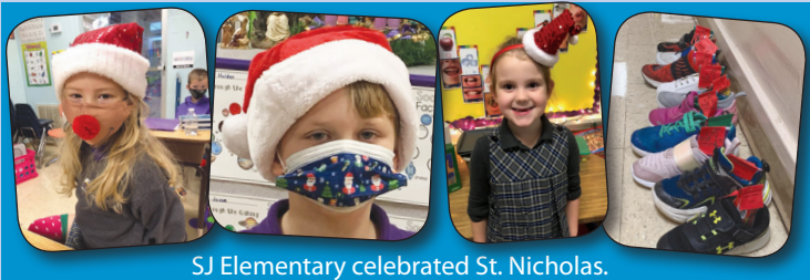
SJ Elementary celebrated St. Nicholas.