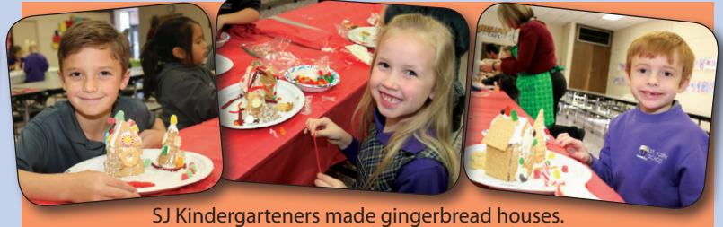
SJ Kindergarteners made gingerbread houses.